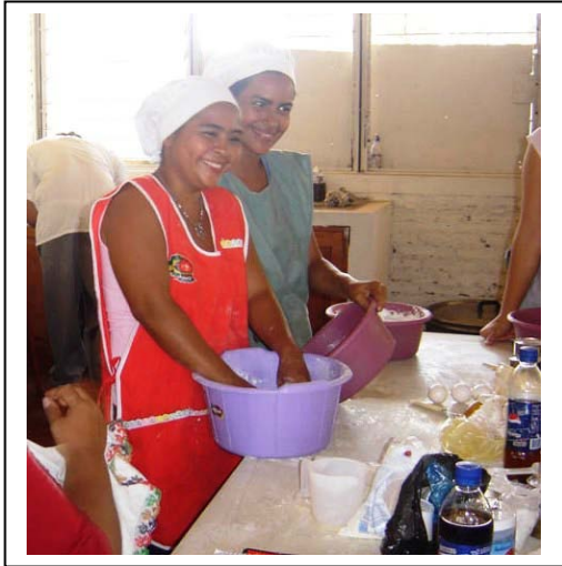
Baking classes at the W/NP Learning Centers

Non-Profit Organization U.S. Postage PAID Permit No. 19 Stevens Point, WI 54481