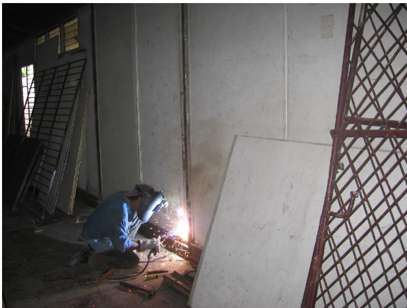
Julio welding the side walls inside - this is the warehouse area of the building - soon to be an area for teaching sewing machine and bicycle repair. One objective in this renovation is to better utilize the space available by providing areas for teaching and skill development.