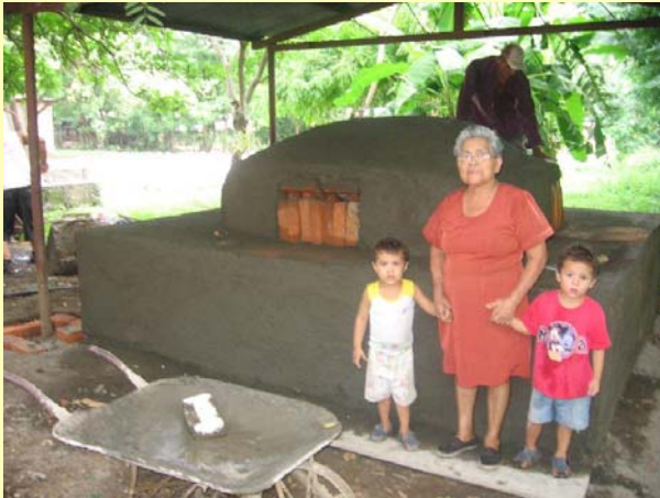
New oven for Bakery

Below is an excerpt for the 2008 Learning Center report, click here for website page to view full report. This report submitted from our Managua office, covers the years 2000-2008, please note the training alone in 2008 is over 2400 students in different areas - truly remarkable given the resources we have to work with!