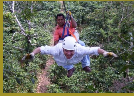
Take a break from the long Wisconsin winter with an adventure that explores the unique biodiversity in our Partner Country of Nicaragua. There is still a couple spots available for the Eco Tour so email us today!