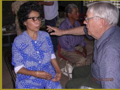
16 Wisconsinites are working along with their Nicaraguan counterparts to fit eyeglasses this week - last year over 1800 pair were distributed over 5 days.